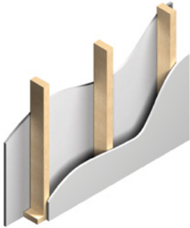
STC 29: wood stud