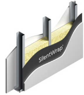
STC 53: steel stud + insulation + SilentWrap