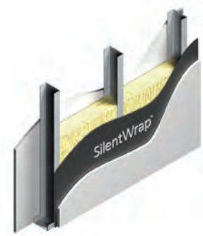
STC 53: steel stud + insulation + SilentWrap

For more information, please visit us at: www.SoundAcousticSolutions.com Toll Free: (877) 399-9697 | Email: info@SoundAcousticSolutions.com