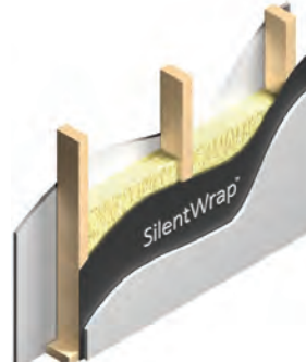
STC 51: wood stud + insulation + SilentWrap