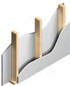
STC 29: wood stud