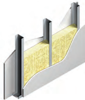
STC 42: steel stud + insulation