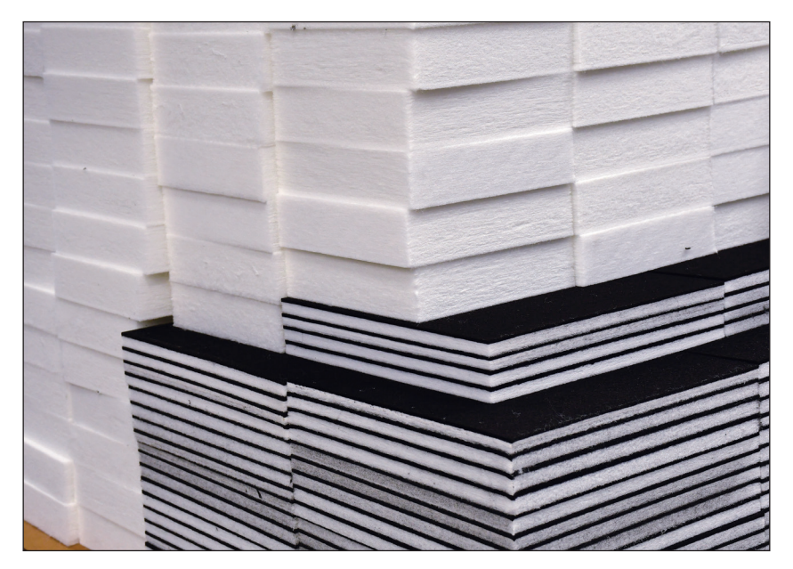
Have material that you need cut to custom sizes? We can help, consult with us today.

High density 11# sheets are also available at \frac{1}{8} " and 9mm. All sheets are at 48" x 96". Please consult sales for other custom dimensions.