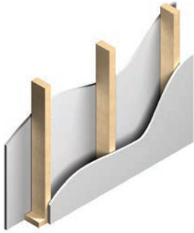
STC 29: wood stud