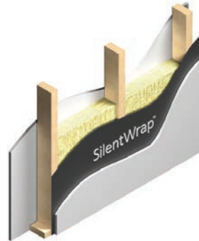
STC 51: wood stud + insulation + SilentWrap