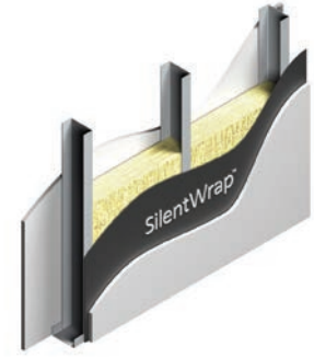
STC 53: steel stud + insulation + SilentWrap